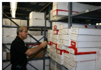
The Contra Costa warehouse is around 20,000 sq. ft., and holds evidence for the Sheriff's Department, DOJ WestNET, Contra Costa Courts and 4 contract cities. Maintaining 60,000 items of evidence at any given time integrity and accountability is vital.