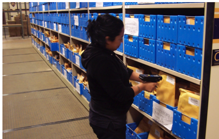
San Antonio Police Department , TX - Reduced there staff hours by over 70% by modernizing their evidence management system. Increasing not only department efficiency but integrity.

At the core of any automated evidence management system is its barcoding capability. The barcode allows the evidence room personnel to manage and record the flow of evidence while it is in the possession of the law enforcement agency. Each time an evidence item is placed on the shelf in the evidence room, the evidence technician can scan the bar code label at that location, then scan the bar code label on the evidence item. Barcode scanning is far more accurate and faster than manual tracking methods. Therefore, its use not only reduces chances for human error leading to missing evidence, but barcode scanning greatly improves work efficiency within property rooms, too.